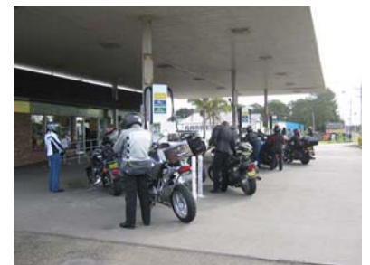
Fueling up at Forster