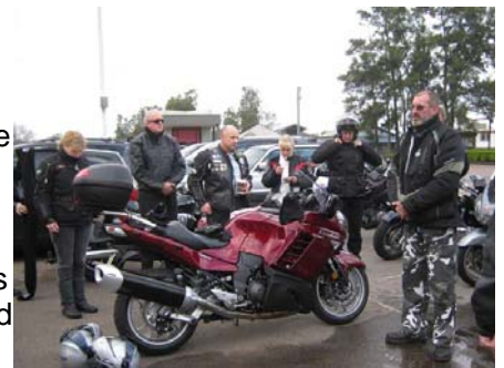
What a fantastic new bike!

We left Hexham Maccas heading up the highway and re-grouping at O'Sullivan's Retreat then on to Forster via the Lakes way for a much welcomed hot drink and a cake while sitting by the sea side. After a chin wag and rest we headed for lunch at Krambach Hotel via Nabic.