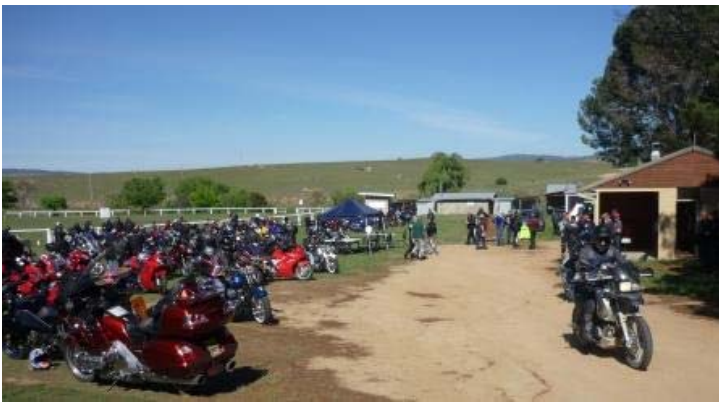
Dalgety showground with green pastures