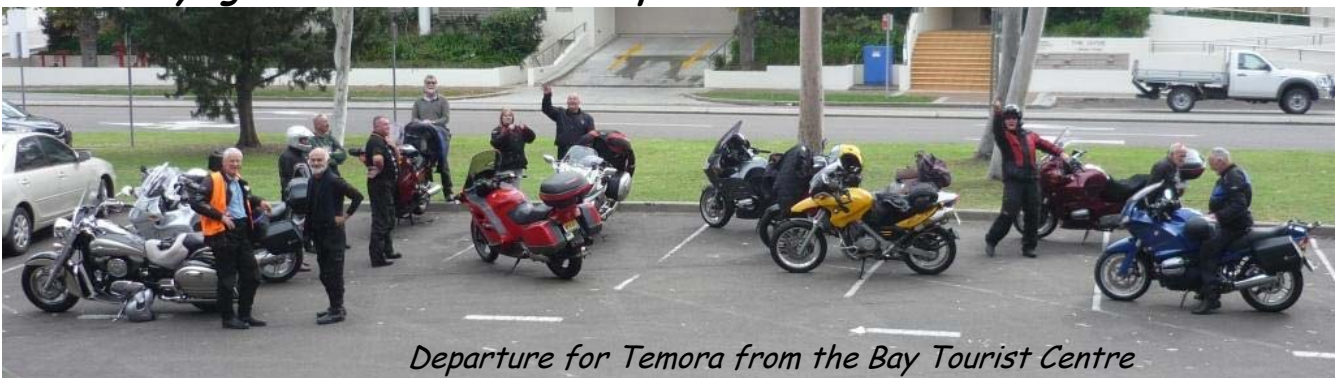
Departure for Temora from the Bay Tourist Centre