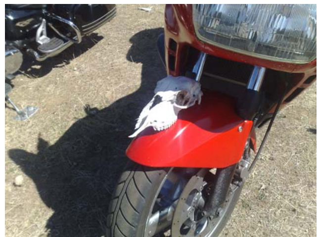
Hans's latest trophy he picked up at Taralga.

Hans Ottevanger hansot@bigpond.com . 44 72 3543 or 0412 017 748