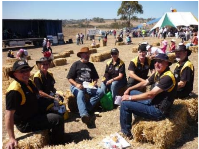
Very comfortable hay bales