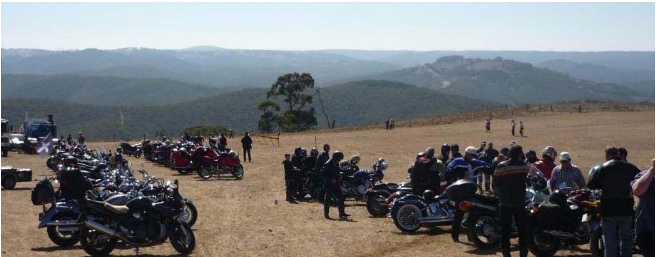
The great scenery at the site of the official opening overlooking the Abercrombie Valley More photos can be found on our website