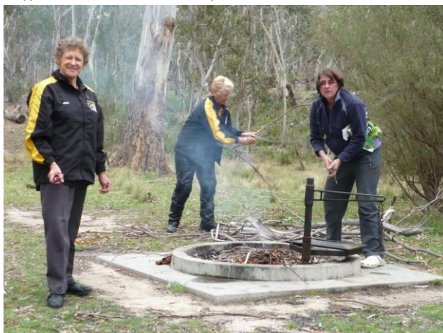
The ladies starting the fire, well done.