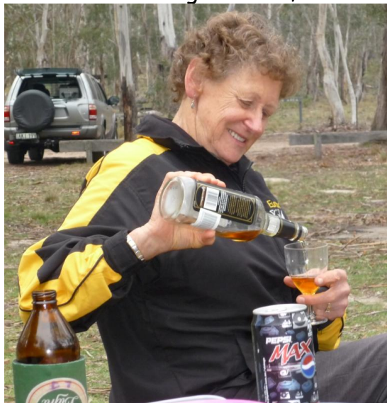
Old fashioned remedy for cold weather.