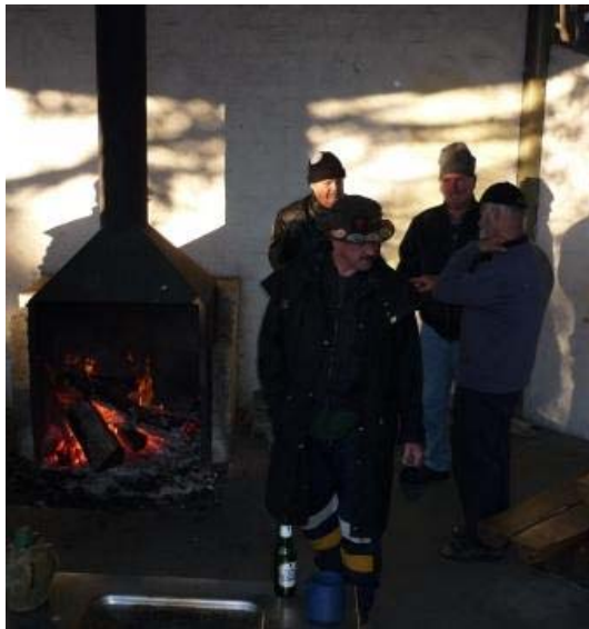
Early morning fire