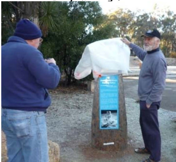
Unofficial unveiling of the memorial of the 40 years since the 1 st Moon Landing 2 days early.