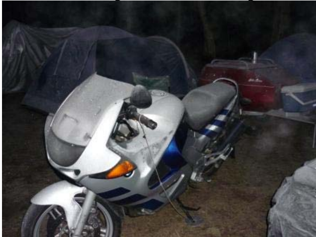
A very cold -5

My sidecar is still being made and will be a while until the leading link is designed. With mine there are at least five GL 1800's outfits being built and completed at this time. With the line up of other