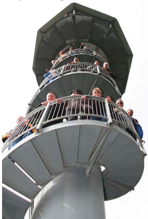
The Illawarra Fly More photos on our website

The trip to the Illawarra Fly Tree Top Walk and overnight stay at Easts Kiama was enjoyed by most who went along from all reports. Too bad about the return trip from the club on Saturday night with the courtesy bus breaking down.