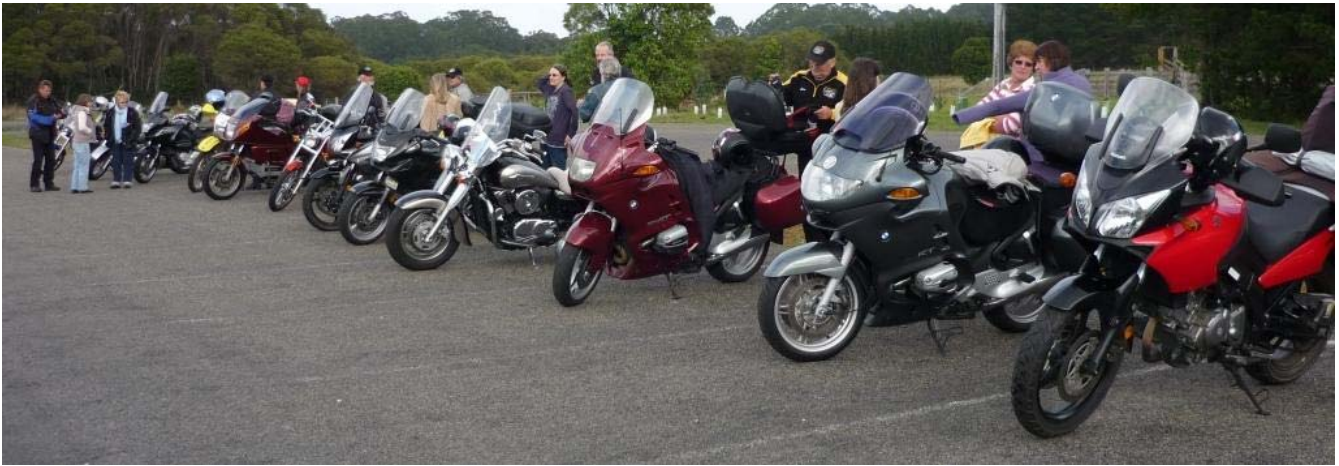
An impressive Eurobodalla line up at the Illawarra Fly more photos on the website