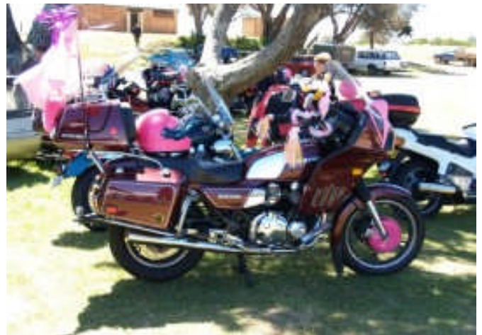
Dan's "The Best Dressed Breast Bike"