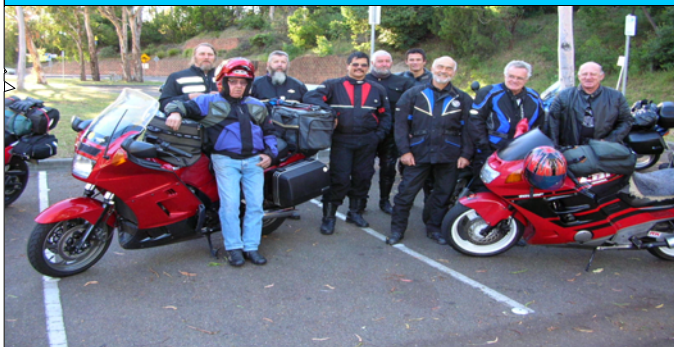
"The Terrific Ten" and their nice clean bikes, 0800hrs, Batemans Bay, 10th Feb, 2006. Day one, Karuha, River Rally Run.

The brainchild of our ride coordinator (Rob), "The Terrific-Ten" were cobbled together from, who-knows-where, for the 2006, BMW Touring Club of NSW, Karuah River Rally run, held over the 11th, 12th February 2006.