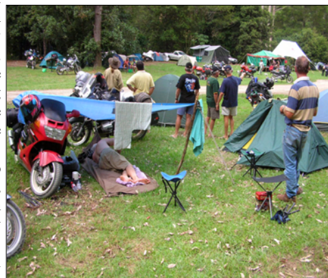
Frying Pan Creek, Gloucester State Forest. The venue for the BMW rally since the late 1970s.

Trip Comments: The rally was considered to be one of the best four day runs done by the group, made even better by the good-fun company, weather and similarly pace-matched riders. If going next year, get there early on the Saturday in order to get a good group camp site. The $20 rally fee was considered a bit steep considering all one got was a badge and soggy sausage sandwich for breakfast. The raffle had to be rigged because none of the Eurobodalla lads won anything. UHF radios and helmet communications are the way to go on long group runs. They not only allow dirty jokes to be told on the move, they increase rider safety, allow the group to be informed of routes, turns, stops and women bathing topless. Many thanks to Rob for the ride organization and all that did the rally run. I look forward to doing it again next year with all you disgusting lot and others from the Branch (apologies to Goldwing and Postie bike owners and Dick for the mustard thing). Ed.