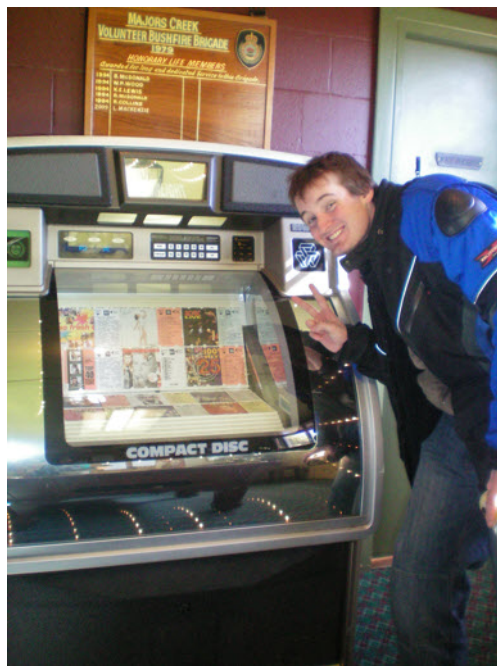
Discarded furniture from the Tardis? (sounds from our youth?)