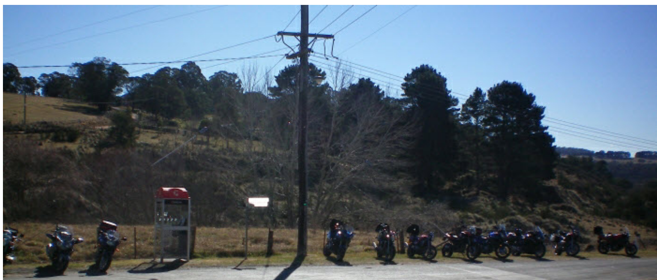
The Riders are in the Tardis