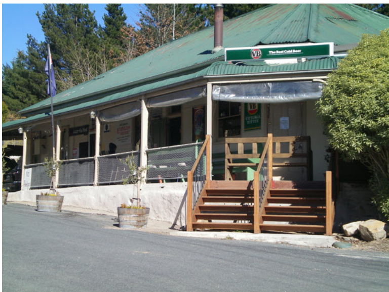
Majors Creek Pub - Warm!!!