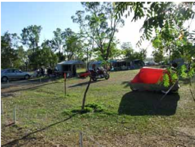
Camping area at Theresa Ck dam