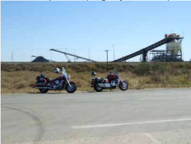
Sonoma Mine (Long Way Round Ride)