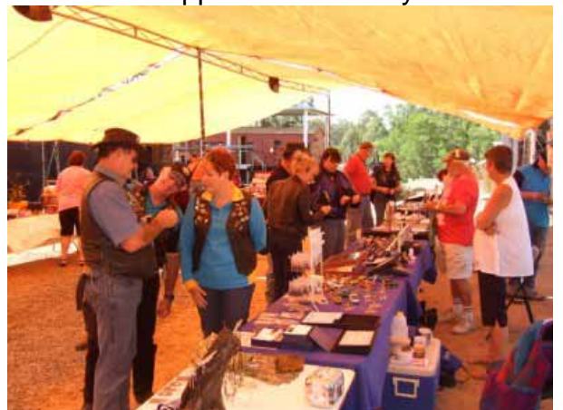
Shop till you Drop @ Clermont markets.