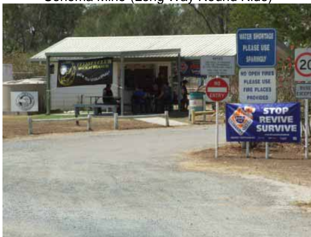
Driver Reviver Weekend