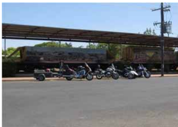
Railway Wagon Mural