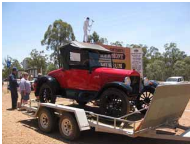
T Model Ford

One of the locals brought along his T Model which was very popular with locals and Ulyssians alike. Before heading back to the dam a couple of groups visited the railway wagon murals in town for some photos.