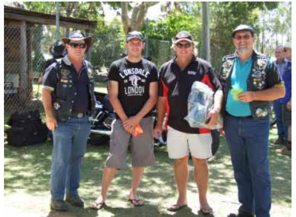
The winners and runner up in Show and Shine