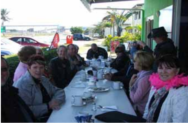
and a view from the other