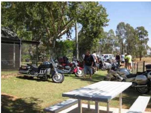
Some of our bikes on display at the museum.

On Saturday arvo a small group at the dam decided to cool off with a swim, however, the swim was cut short when Fluffy, then Moo were bitten by something lurking in the shallows. Apparently the culprit was a catfish, the size of this fish seemed to get bigger as the weekend went on and the bush telegraph went to work and latest news is that the good folk of Clermont have a rival to Nessie lurking in their local waterhole.