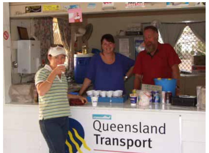
A thirsty traveller