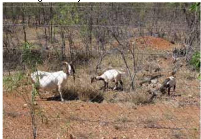
Some of the locals – just kidding!