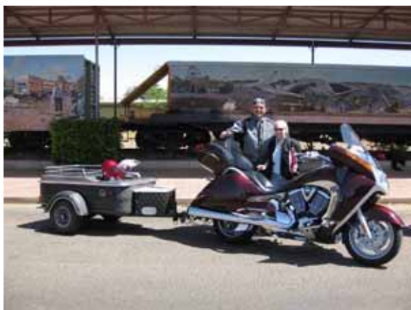
Swampy and Lea at Railway Mural

One of the locals brought along his T Model which was very popular with locals and Ulyssians alike. Before heading back to the dam a couple of groups visited the railway wagon murals in town for some photos.