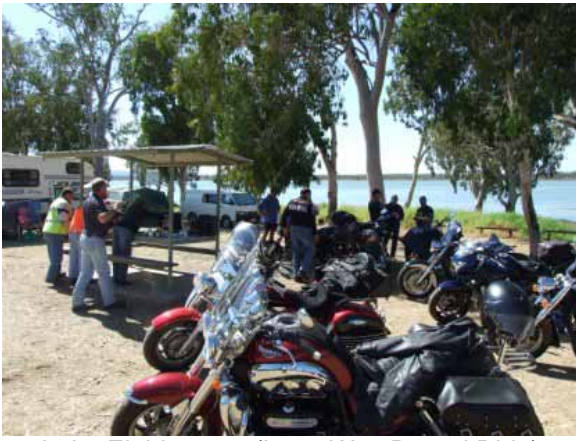
Lake Elphinstone (Long Way Round Ride)