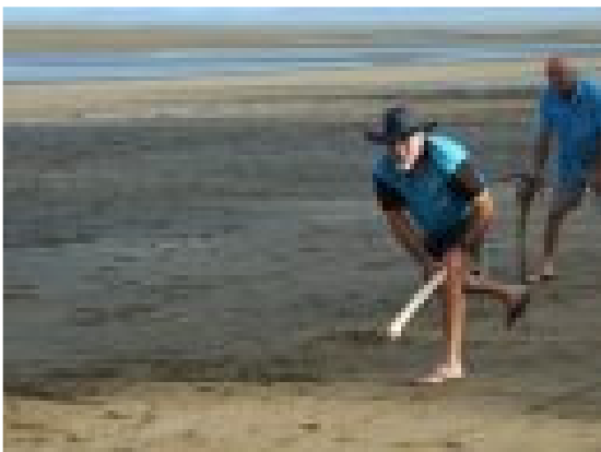
Snatching a quick run