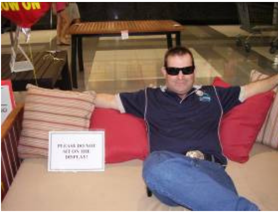
Possum shopping at Airlie Beach