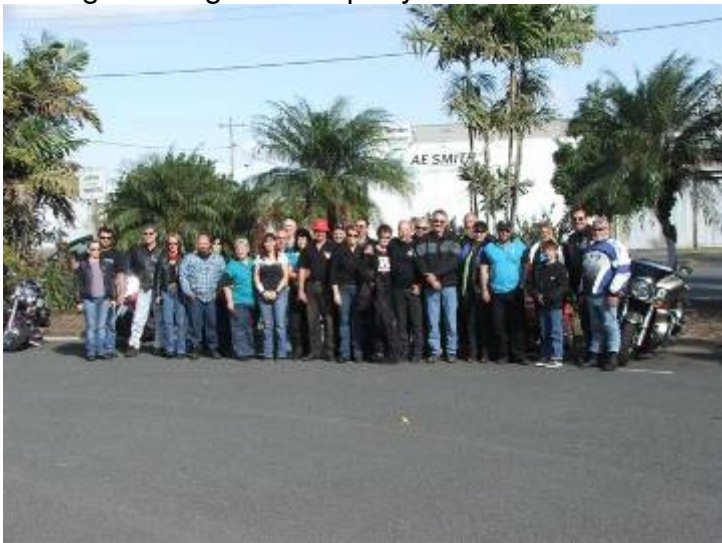
Posh Frock Night

A very nice relaxing morning was had with lots of laughs and great company.