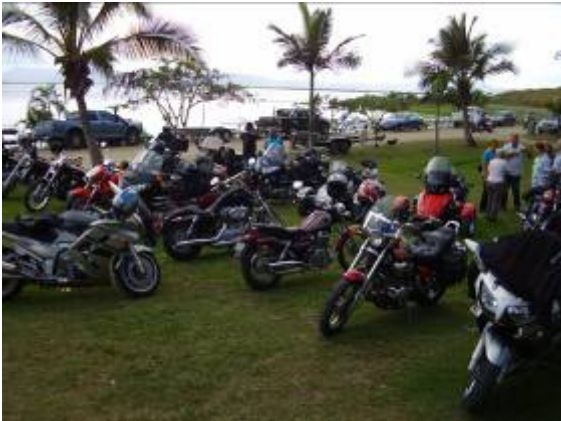
Some of the 45 who attended Kinchant for lunch