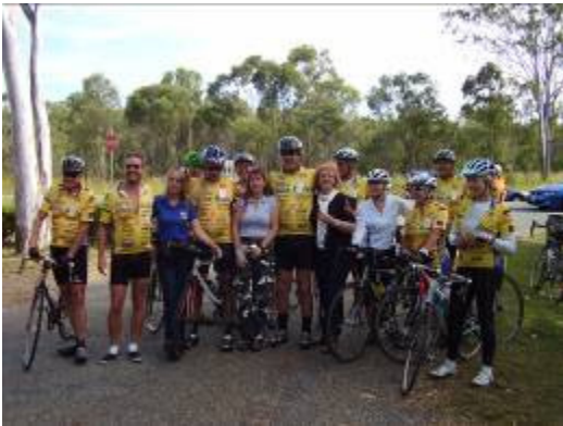
Biking for charity a group we encountered at the ice cream Shoppe