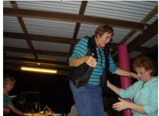
It wasn't the Table dancer