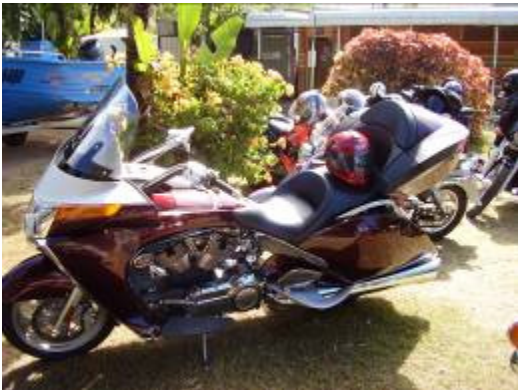
Swampy parks the NEW Victory in a conspicuous spot at Clairview