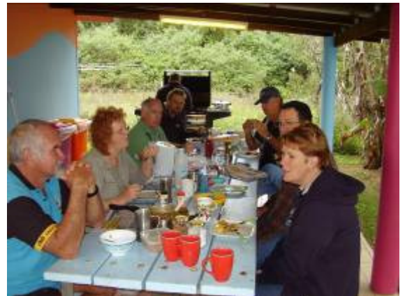
Lunch @ Conway Beach