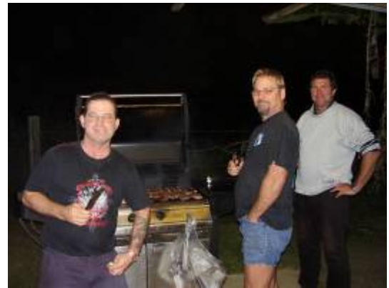
Yep it was the cooks