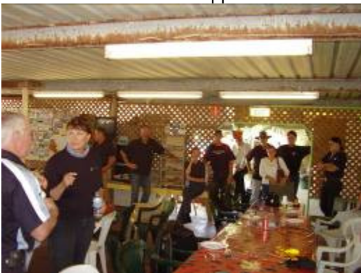
Lunch at the Caravan Park