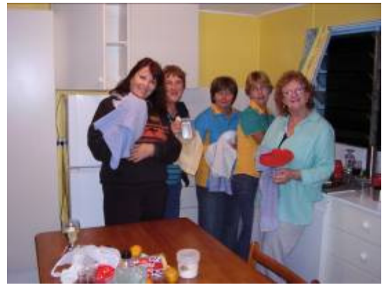
Who said a Woman's place is in the kitchen at Conway