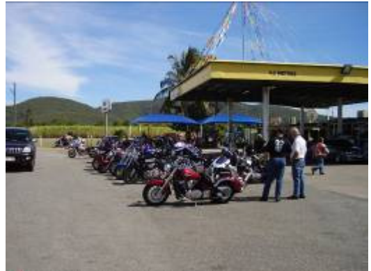
Now lets see which way is Clairview?