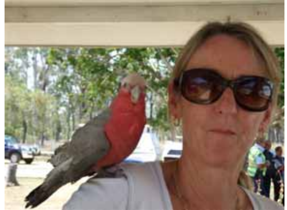
Who's the pretty birdy?