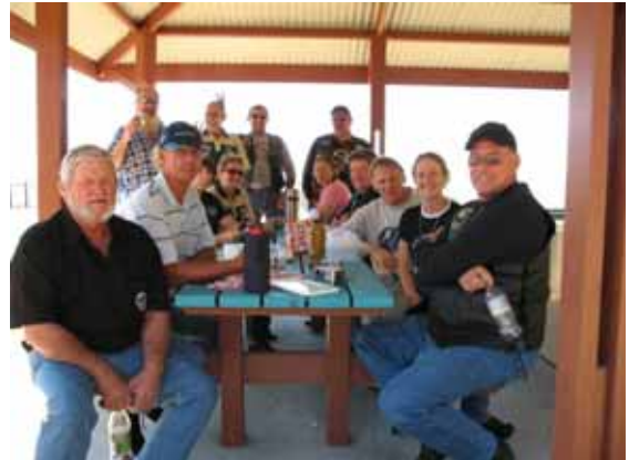
Pictured: The Group (Check out the “immature ones at the rear”)

It started with a bit of a mix up: - “Is it for Breakfast?” or “Is it for Lunch?” It was decided that, seeing it was Father’s Day, lunch would be the better option.