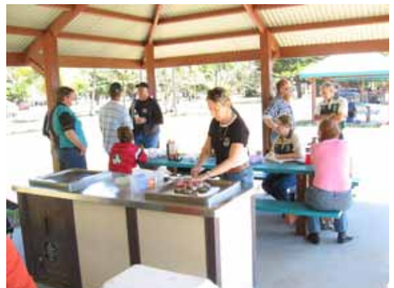
Pictured: Who called the Silly Girl a cook? Who called the Cook a silly girl?